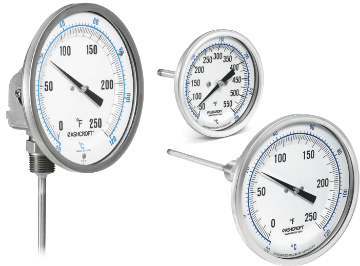
EI Bimetal 2", 3", 5" dial sizes