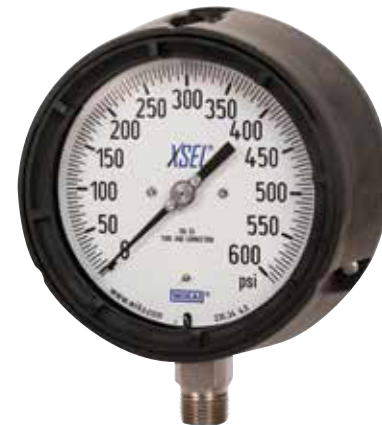
Bourdon Tube Pressure Gauge Model 232.34

Medium: max. +212°F (+100°C) (See Note 1 on reverse)