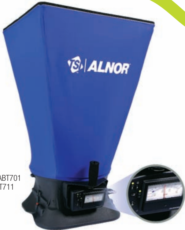
Model ABT701 and ABT711