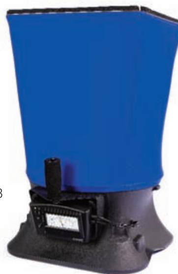
Model ABT703 and ABT713