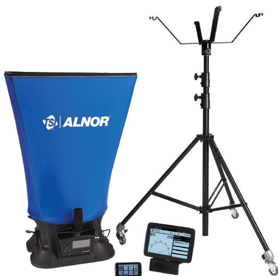
Model EBT731 (Shown with standard and optional accessories)