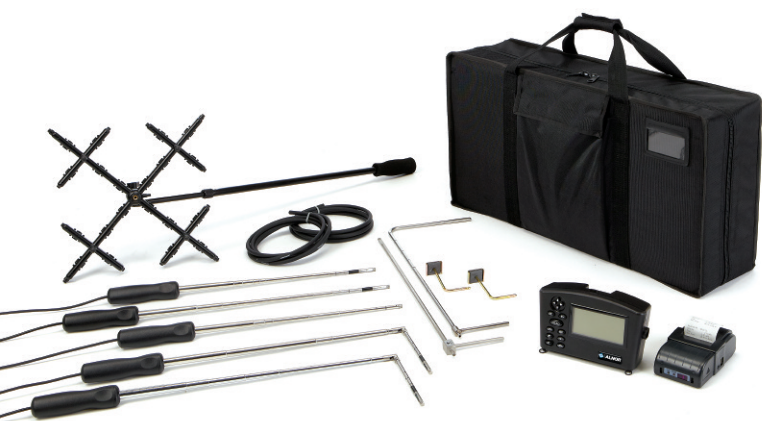
Model EBT730 (Micromanometer shown with standard and optional accessories )