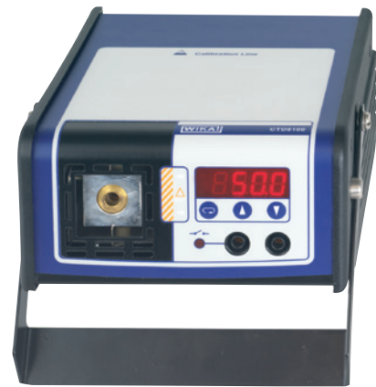
Temperature dry-well calibrator model CTD9100-375