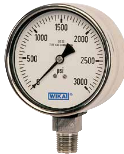
Bourdon Tube Pressure Gauge Model 232.30

Ambient: -40°F to +140°F (-40°C to +60°C) - dry -4°F to +140°F (-20°C to +60°C) - glycerine filled -40°F to +140°F (-40°C to +60°C) - silicone filled Medium: +392°F (+200°C) maximum - dry +212°F (+100°C) maximum - liquid filled