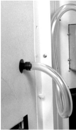
Figure 4: Back view of fascia