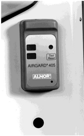
Figure 5: Typical installation

Calibration of this instrument should only be performed by qualified personnel. Proper guidelines for monitoring any ventilation apparatus are established on the basis of toxicity or hazards of the materials used, or the operation conducted within the ventilation apparatus. Personnel calibrating the AirGard 405 monitor must be completely aware of the regulations and guidelines specific to their application.