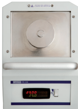
Micro calibration bath model CTB9100-165 with screw-on lid

Two instruments for the temperature range from -35 ... +255 °C (-31 ... +491 °F)