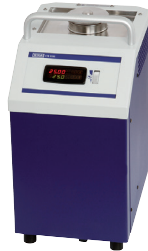
Micro calibration bath model CTB9100-165