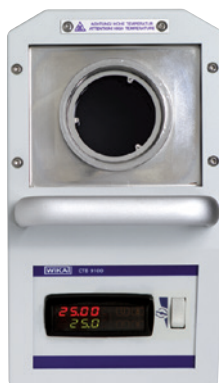
Micro calibration bath model CTB9100-225

This micro calibration bath is an efficient tool for the calibration of thermometers. It works with Peltier elements and can thus reach test temperatures below ambient temperature. New multistage Peltier elements ensure a good long-term stability and high reliability within the entire working range. Due to its capacity for active cooling, it is often used in biotechnology, pharmaceutical and food industries.