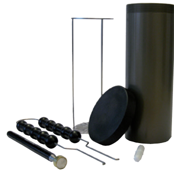
Insert for liquids with accessories