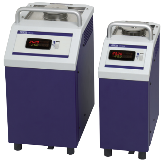
Temperature micro calibration baths