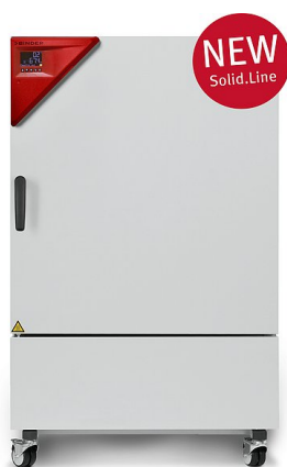
Model KBF-S 240